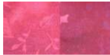
Color C (both)