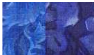
Color A#1 Color A#2