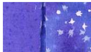
Color B (both)

These are the fabrics I've used so far. As I'm doing this completely from my stash, I have only a certain amount of each fabric, so I'm going to be substituting fabrics as I need to complete this quilt. There's no reason why you can't use 3 or 4 different fabrics of the same color and value for any given Color. My Bkg fabrics are off white and white...I probably shouldn't have photographed them on a tan rug.