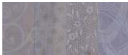
Bkg#4 Bkg#3 Bkg#2 Bkg#1